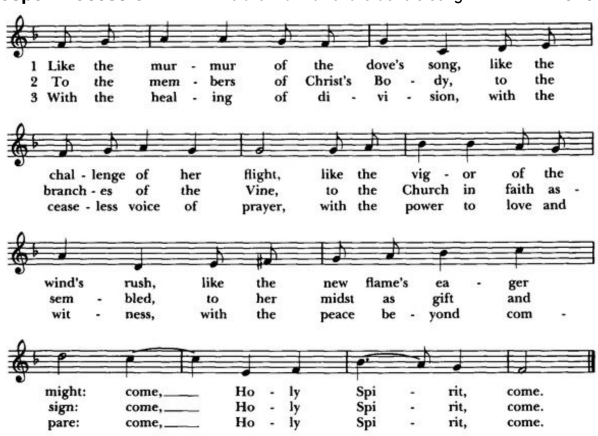
Phrase 1 of each stanza may be sung by one group, with a contrasted group singing phrase 2, and all joining for the final phrase.