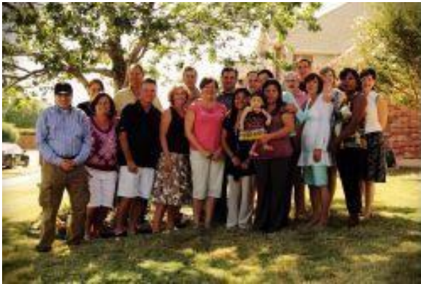
Family Portrait: A graduated Sister in Dallas, TX and her Table.

Each Table is hosted by a congregation (up to three congregations may share a Table). A required team of volunteers (10-12 people help an adult or family and 6-7 help a young adult transitioning out of foster care or a veteran) serve over an 8 – 12 month period. Tables generally meet once a week and often at a lesser intensity as the work progresses. Table members are primarily generalists, work as teams and also provide leadership for important life domains (see Open Table model diagram). A national team of volunteer Open Table Coaches train a volunteer Congregation Coordinator in each faith community to lead the model and launch Tables.