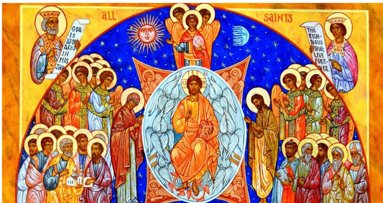
All Saints' Day