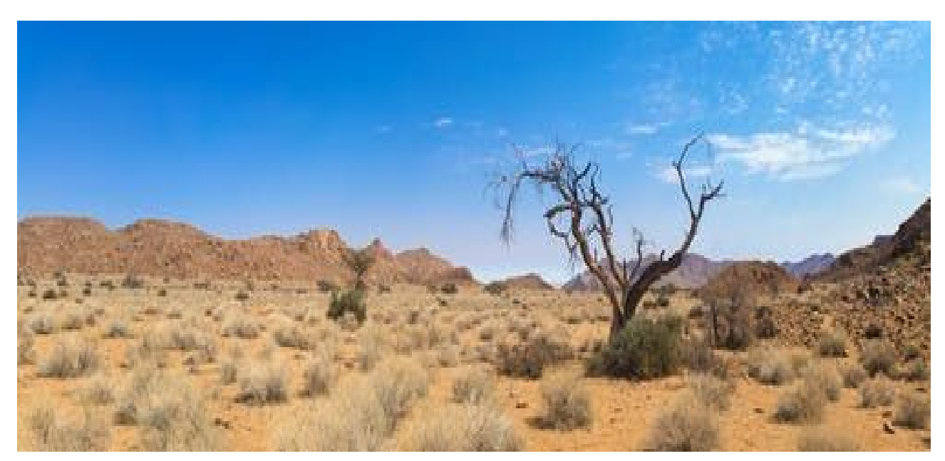
"Let the wilderness lift up its voice." Isaiah 42:11

Welcome! This Sunday and the next call us to join in the hymn of all creation — with the wrens and robins, otters and owls, baboons and butterflies, elm trees and pine trees, rice and snow peas, grass and grasshoppers, lava and lake, mountains and seas — all created things everywhere. We are invited to join the communion of all creation to let heaven and nature sing and to let all creation join as one, to praise God's holy name. All together the choir of creation acknowledges God as the inexhaustible source of life and goodness.*