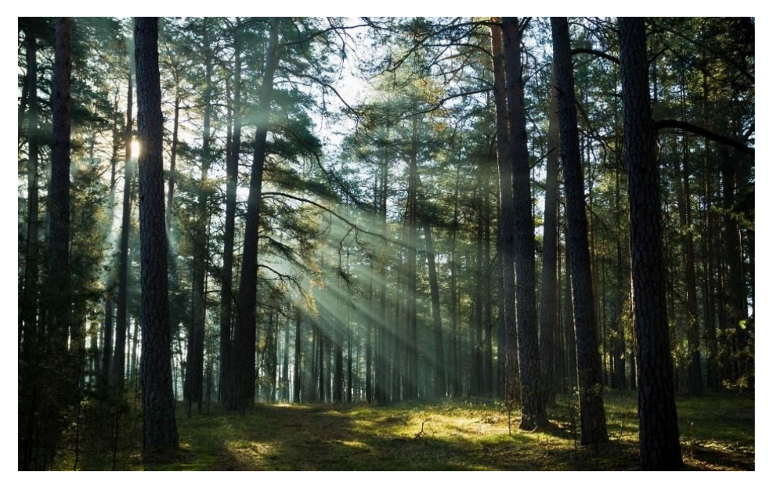
"All of the trees of the field sing for joy". Psalm 96:12

Welcome! This Sunday and the next three call us to join in the hymn of all creation — with the wrens and robins, otters and owls, baboons and butterflies, elm trees and pine trees, rice and snow peas, grass and grasshoppers, lava and lake, mountains and seas — all created things everywhere. We are invited to join the communion of all creation to let heaven and nature sing and to let all creation join as one, to praise God's holy name. All together the choir of creation acknowledges God as the inexhaustible source of life and goodness.*