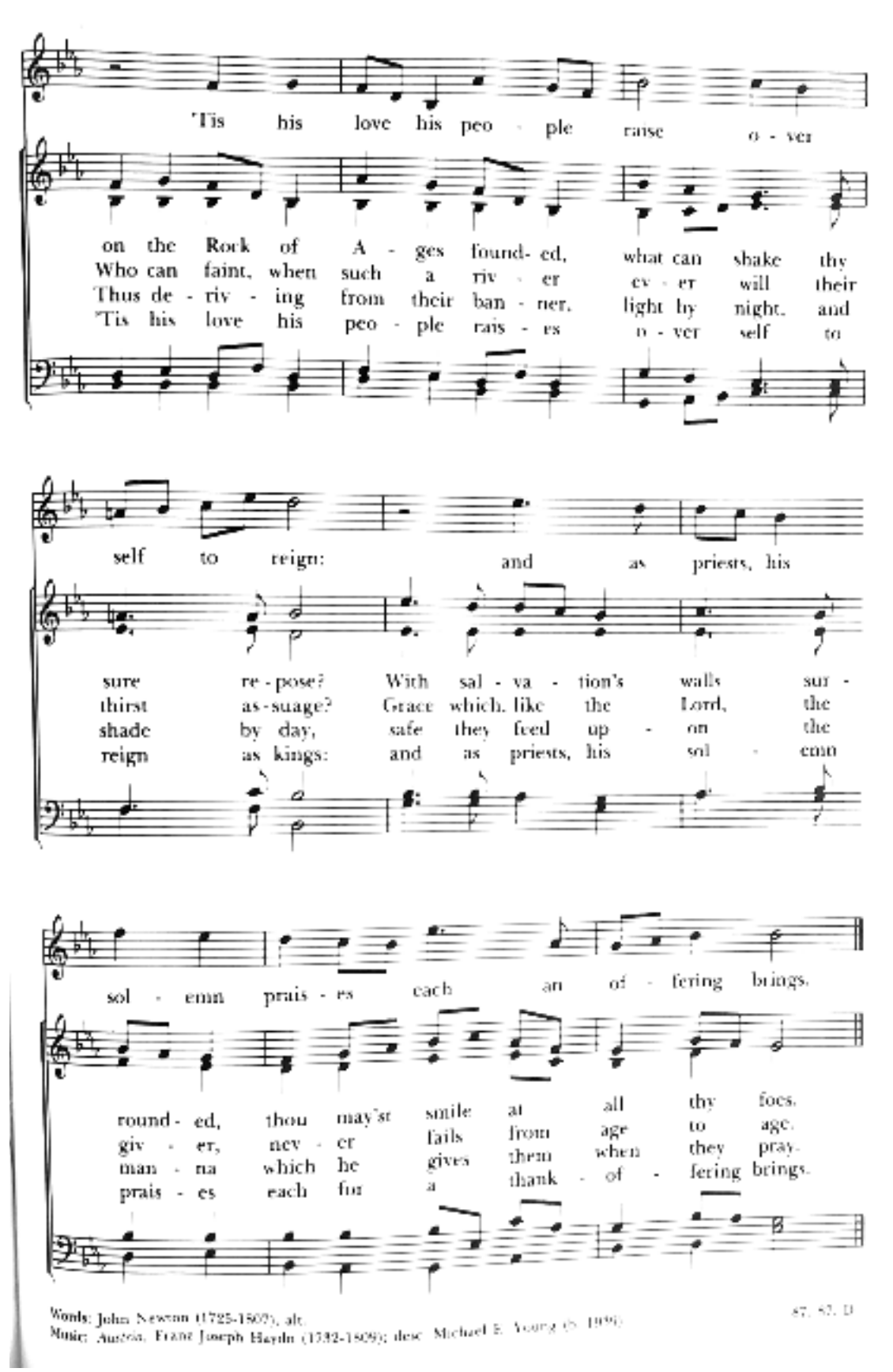
Permission to reprint, podcast, and / or stream the music in this service obtained from OneLicense #A-723401 and CCLI License #11355446