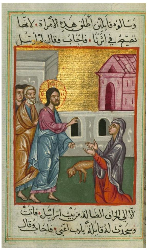
Image: <u>The Canaanite Woman asks for healing for her daughter</u> Naskh is the caligraphic style for writing in the Arabic alphabet that the biblical text is written in for this manuscript. The artist, Ilyas Basim Khuri Bazzi Rahib, was most likely a Coptic monk in the late 17th century in Egypt. 1684 from Art in the Christian Tradition, a project of the Vanderbilt Divinity Library, Nashville, TN.