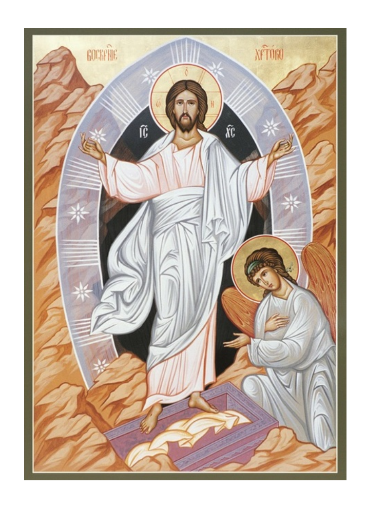
"Christ is Risen!"